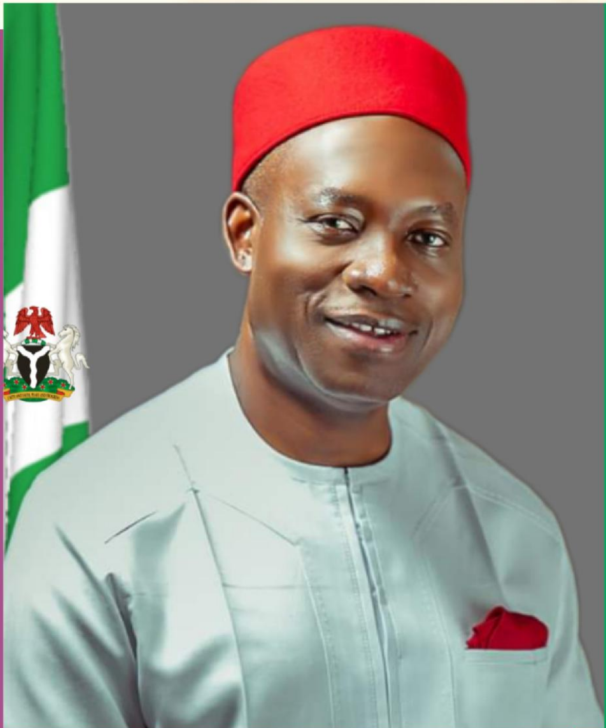
PROF. CHARLSE CHUKWUMA SOLUDO Governor, Anambra State