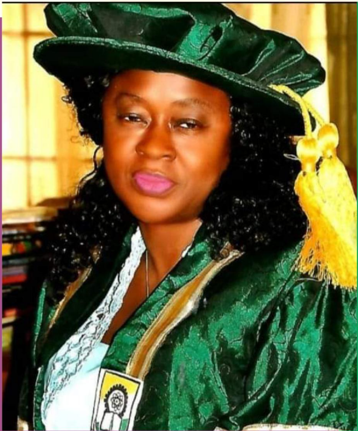
PROF. NGOZI CHUMA-UDE Hon. Commissioner for Education